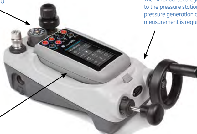
PV620G Pressure Station. The DPI620G securely attaches to the pressure stations when pressure generation and measurement is required