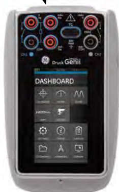
Measure and source mA, mV, V, ohms, frequency, RTD's and thermocouples