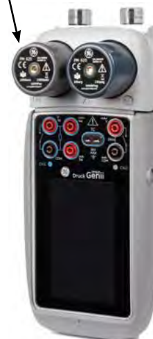
MC620G Pressure Module Carrier. Securely attaches to the DPI620G when pressure measurement is required