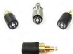
Relief Valve Table